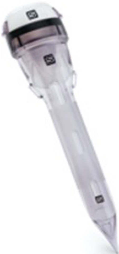
Fig. 3 19 mm Standard Trocar for use with Titan SGS stapler

of the liver, repair or removal of the spleen) need for re-operation for missed injury directly due to the stapler