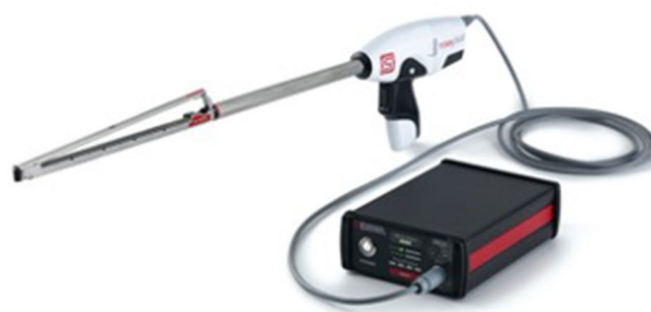
Fig. 1 Titan SGS stapling device and power cord

Participants were selected from the trial physicians’ existing patient populations and screened for eligibility. Inclusion criteria were defined as patients age 18 to 65 undergoing a