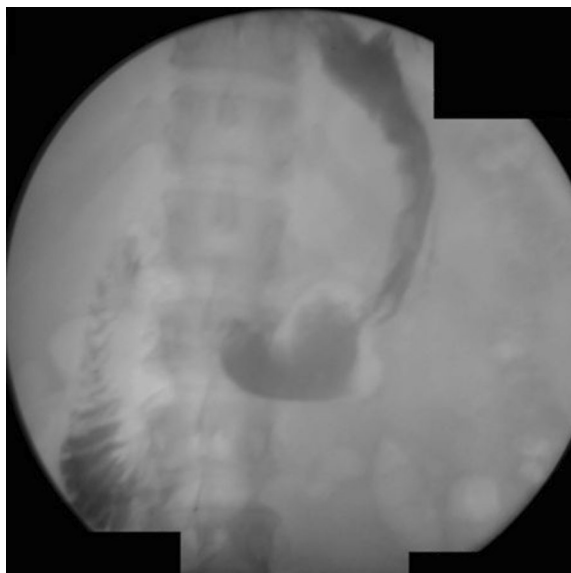
Fig. 4 Example of Upper GI study

Confidence intervals were to be understood as two-sided confidence intervals.